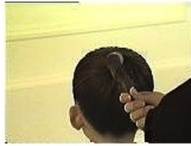
4. Twist Hair