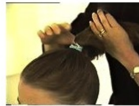
3. Hair Band