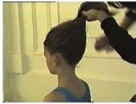
1. Gather Hair