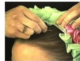
9. Headpiece if Desired