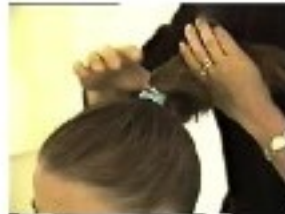
3. Hair Band