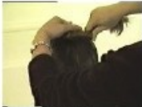
5. Coil Hair