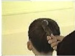
4. Twist Hair