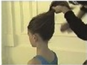
1. Gather Hair