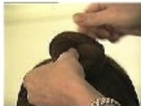
8. Flatten (optional)