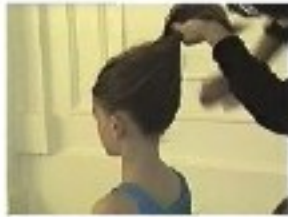
1. Gather Hair