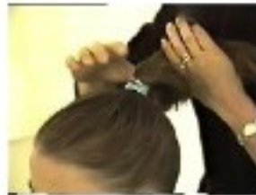
3. Hair Band