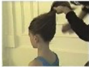
1. Gather Hair