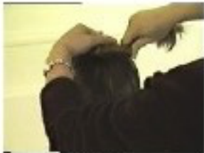
5. Coil Hair