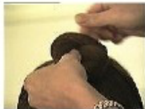
8. Flatten (optional)